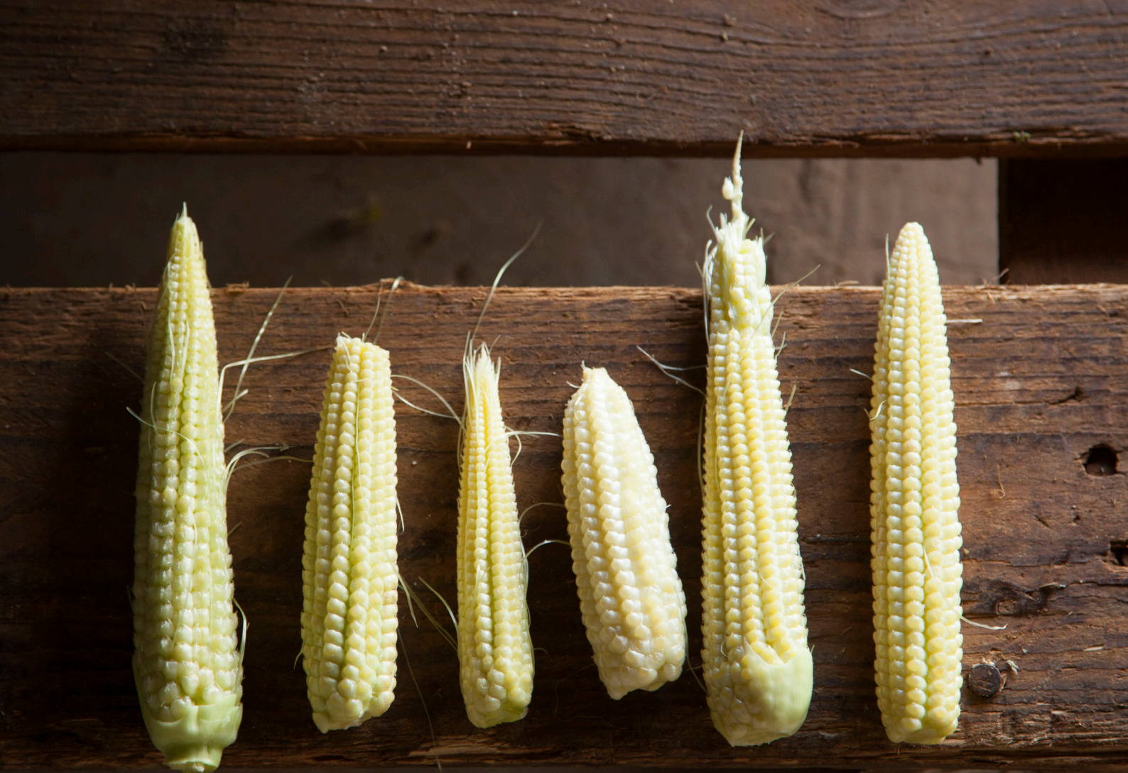
Baby corn rejected for being (l-r) too long; too thick; too small; too thick; too long; too long